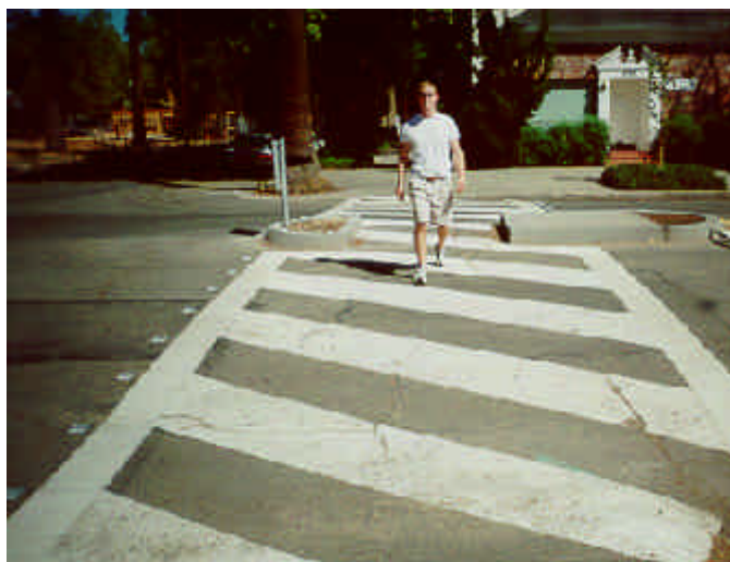
Figure 10. Pedestrian in crosswalk with refuge island, Sacramento, California.