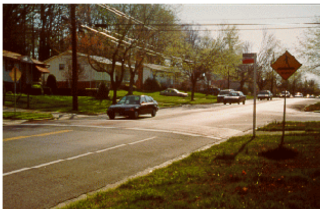
Figure 7. Raised crosswalk, Bel Pre Road at Merton Road, Montgomery County, Maryland.

Bel Pre Road at Merton Road is in a residential area just outside of Rockville, MD. Bel Pre is a northwest-southeast collector, with one lane of traffic in each direction and parking lanes on both sides. Merton Road is a local street that approaches from the southwest and forms a T-intersection with Bel Pre Road. The raised crosswalk is on the northwest leg of the intersection, and the control site is on the southeast leg of the same intersection (Figure 7).