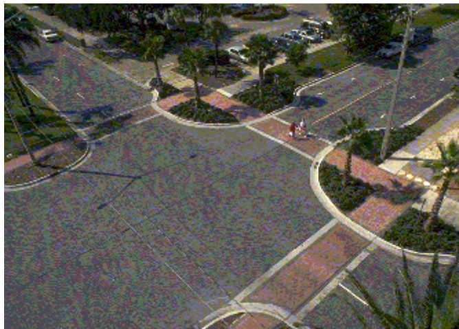
Figure 3. Bulbouts shorten crossing distances for pedestrians, improve sight distances, and may slow vehicle speeds.

In Ontario, Canada, Macbeth (10) reported speed reductions on five raised and narrowed intersections and seven mid-block bulbouts, in conjunction with lowering the speed limit to 30 km/h. The proportion of motorists who exceeded 30 km/h was 86 percent before the devices were built, but only 20 percent afterwards.