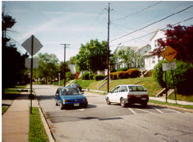
Figure 1. Two vehicles slow down as they pass over a speed hump.