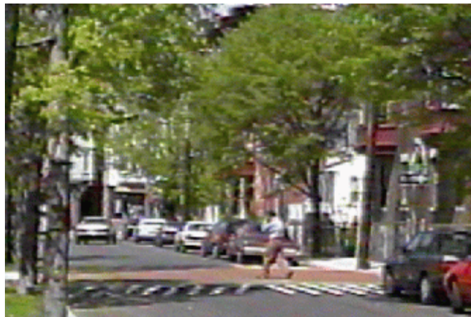
Figure 8. Raised intersection, Berkshire Street and Marcella Street, Cambridge, Massachusetts.

The chi-square statistic was used to compare the percentages of pedestrians who crossed in the crosswalk in the before and after periods. In the before period, 11.5 percent of pedestrians (N = 104) crossed in the crosswalk. This percentage increased to 38.3 percent (N = 47) in the after