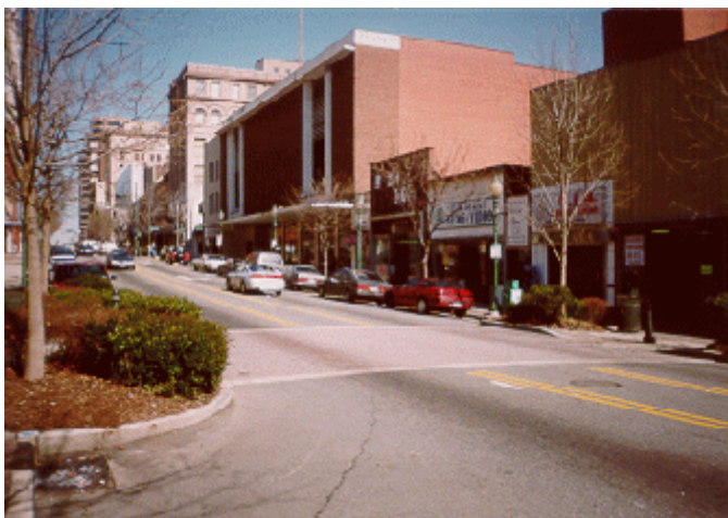
Figure 5. Bulbout and textured crosswalk, Greensboro, North Carolina.

A laser speed measurement gun was used in Richmond to measure the speeds of vehicles, in one direction, at the crossing and about 92 to 183 m (300 ft to 400 ft) upstream from the crossing, when the staged pedestrian was present at the crossing. Speeds were measured for a total of 132 vehicles at the bulbouts and 132 vehicles at the control sites.