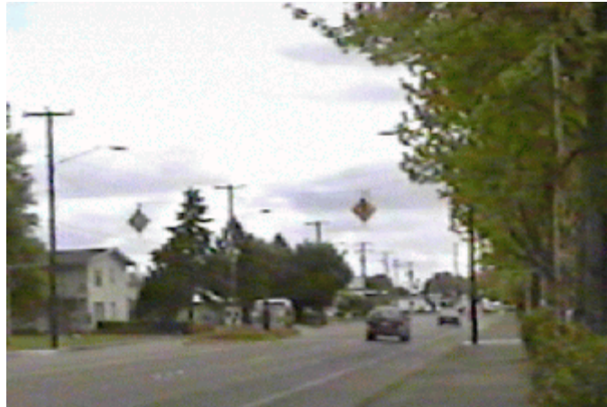
Figure 9. Refuge island, Circle Boulevard, Corvallis, Oregon.

The average wait time was 0.04 s (N = 104) in the before period and 0.00 s (N = 47) in the after period. According to the t test for difference in means, this change was not statistically significant. Because traffic volumes were very light, the majority of pedestrians crossed without having to wait for a gap in traffic, so the average wait times were very short.