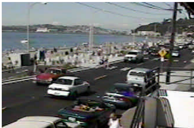
Figure 4. A motorist yielding to pedestrians, Alki at 59 th , Seattle.