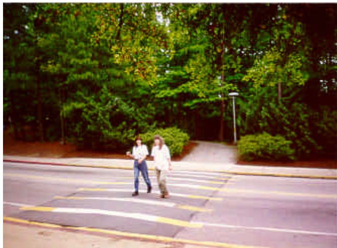
Figure 2. Pedestrians using a raised crosswalk.

Speed humps have been evaluated in many cities. The following paragraphs summarize some of those studies.